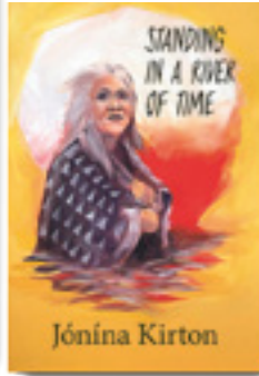
Standing in a River of Time