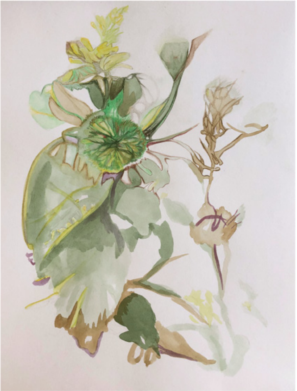
Natalie Purschwitz / Weeds 1 — drawing based on GAN (AI) generated imagery (ongoing series), 2022 / stinging nettle, coffee, chlorophyll,