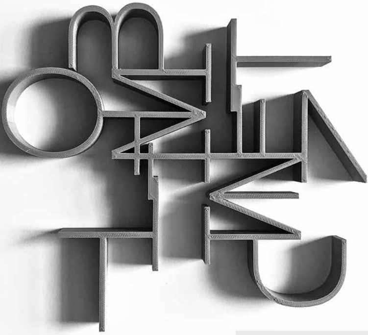
Eric Schmaltz, Embodiment , 2018, biodegradable plastic filament, approximately 8 x 10 inches