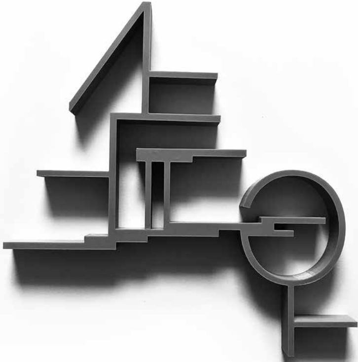
Eric Schmalz, Feeling , 2018, biodegradable plastic filament, approximately 8 x 10 inches