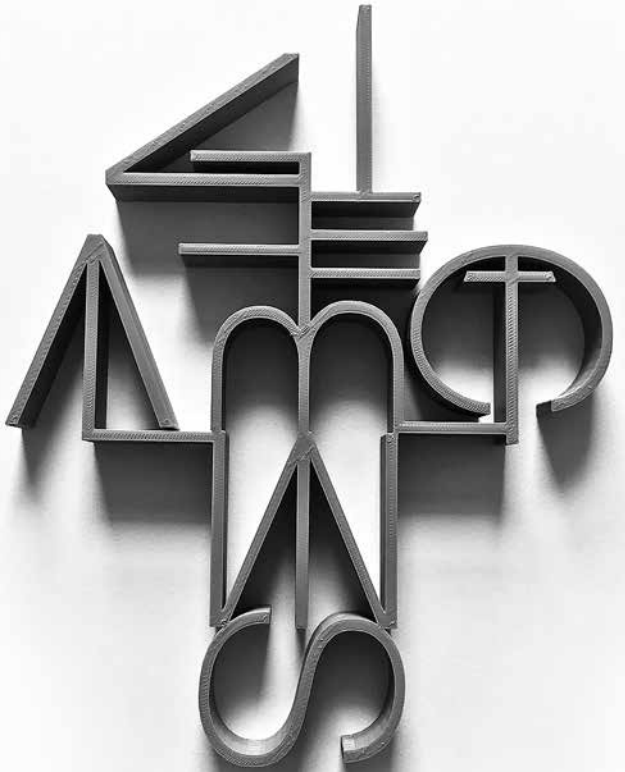
Eric Schmaltz, Semblance , 2018, biodegradable plastic filament, approximately 8 x 10 inches